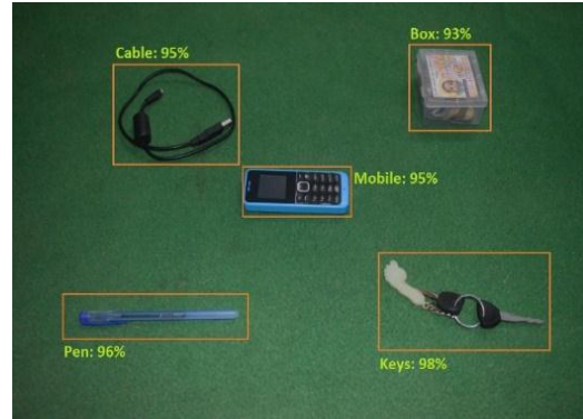
Figure 3(b) Object detection with its accuracy