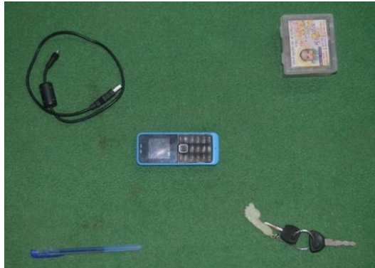
Figure 3(a) Normal things comes in daily usage

A support of batteries gives amenities to make it portable and carry whenever required to desired place.