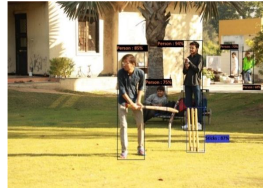
Figure 4(b) Human detection with its accuracy