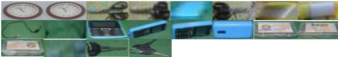
Figure 2 Training module

This array includes some of the pictures that we had included in our pre-processing model, from certain possible angles.