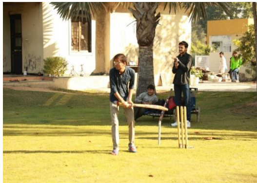
Figure 4(a) Natural scenario to elaborate blind