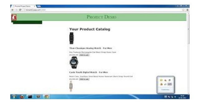
Figure 4: View of Tenant 2 System with its

The above figure shows a store of tenant1 which has subdomain 'tenant1' for domain 'saas.com'. The above diagram represents the book shop as one of the two tenants.