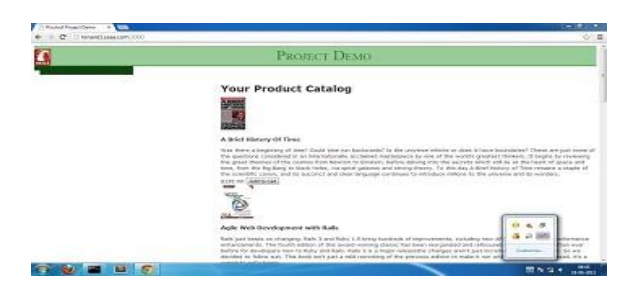
Figure 3: View of Tenant 1 System with its subdomain

In case of single tenant e-commerce application, it can have only one store to purchase or sell products. In our multitenant e-commerce application we have 2 tenants selling their products from their respective store shown using different tenants.