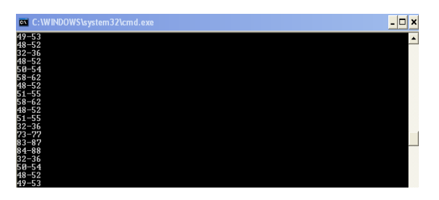
Fig 4.2: internally information is being reviewed for illegal intruder accessing the information